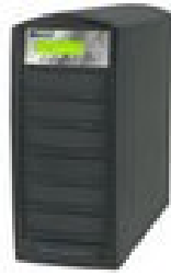
Standalone CD/DVD Duplicator

If you're creating a large number of CD's or DVD's, you may want to look into getting a stand-alone duplicator. Be sure to get one that creates both CD's and DVD's. The more expensive models have a hard drive that can store “images” of the discs you've created, but burning from disc to disc on a low speed can also be quite dependable. It is never advised to use two drives in a computer to duplicate discs. Even on a low speed, this is not a dependable solution. CD and DVD duplicators are created specifically to duplicate reliably. Significant savings can be found by purchasing a new duplicator on ebay from a reputable seller. If you want a duplicator that can create 5 discs at a time, do a search for “5 target CD DVD duplicator.” A good quality duplicator with one “Asus” brand master drive and 5 “Sony” recording drives can be purchased for around $380, shipped. I recommend getting a black model, as white cases will yellow over time.