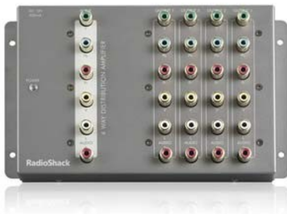
Distribution Amplifier by Radio Shack

Analog : If you'd like to duplicate more than one cassette or video tape at a time, multiple player/recorders need to be purchased. One VCR, for example, serves as the master player. To connect the other VCR's for recording, you will need a distribution amplifier, which is a device that multiplies and amplifies the signal of the master player. Radio Shack carries these for about $50, and can interface with one master and 4 cassette or VCR recorders via RCA jacks.