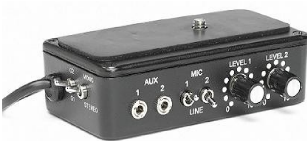
XLR Pro (XLR inputs not visible from this angle)

The 2 input model will give a choice of mono or stereo on a switchable toggle. Use mono mode to ensure both inputs will be heard on even a mono TV.