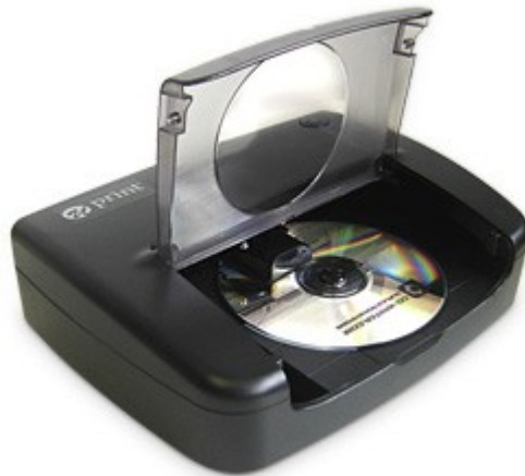
UPrint Thermal Printer

printer that prints directly on the disc, and comes with software so that any font on your computer can be used to create labeling that does not smear. Non-complex images can also be printed. The printer does include one ribbon, and the replacements, which are available in a variety of colors, cost under $20. These ribbons can print over 110 discs when using two lines of text in one section of the disc. Just be sure when ordering DVD's like the Ritek Ridata to get "Ritek Ridata Thermal Printable." These are available in standard silver or white. This printer should also work on your standard lacquer silver finish CD's or DVD's that you are accustomed to seeing if there is not a brand label on the disc. The cost per DVD, including a thermal disc and single section of thermal ribbon, is within 50 cents, and the printing process is very fast.