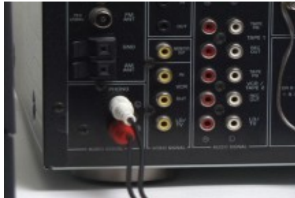
Here are some RCA connections for video (yellow) and line level audio (red and white)

Line Level : RCA connections usually carry line level signals. These are common on the backs of stereo components like CD/DVD players, VCR's and tape players. They are usually stereo, with red and white jacks. Mixers generally have line level outputs on 1/4" or perhaps even XLR jacks. These outputs may be labeled "line out", "main out", "tape out" or similar. These outputs are intended to be fed into an amplifier or another component like a recording device. A headphone output is similar in level (volume) to line level.